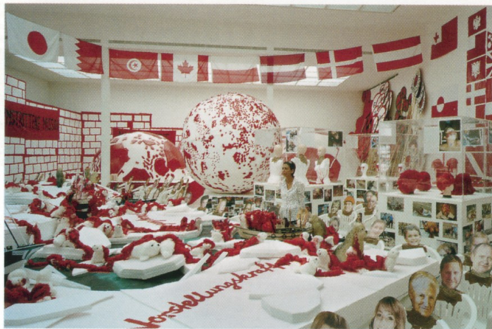
Thomas Hirschhorn Das Auge (The Eye) (installation detail) 2008

► THOMAS HIRSCHHORN The Swiss artist's sprawling installations are breathtakingly graphic and, if not polemic, then violently topical. Das Auge (The Eye) , which premiered at Vienna's Secession in 2008, concerns red. The artist has used the colour before, but here it flares up to gory proportions. Canada figures prominently, with its flag and its infamy as host to the controversial practice of seal clubbing. Opening Feb. 24. The Power Plant, 231 Queens Quay W.