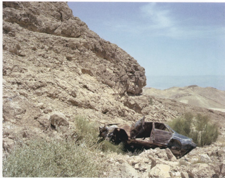
Simon Glass At Rosh Zohar 2008